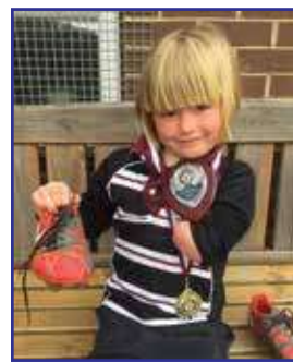
The Under Fives Coaches Award for Old Rishworthians RUFC 2015-16