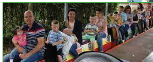
Reach members attending the Open Day at Musgrave Park Hospital in Belfast.